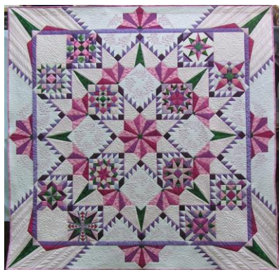
'Generations' 3rd in Traditional Quilts, 2007 World Quilt Competition 1 st place in CQA's NJS Quilt Show