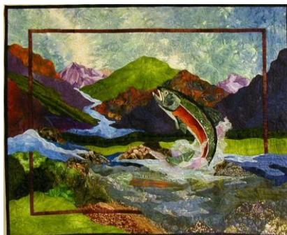
'River Dance' 2005 Award of Excellence, Grand National Exhibition

My work has been exhibited in galleries and quilt shows in North America and Europe receiving awards at Quilt Canada, the World Quilt Competition, and The Grand National Fibre Art Show among others.